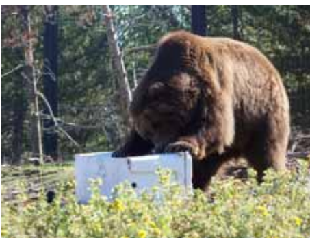
Grizzly testing a cooler at the Grizzly and Wolf Discovery Center in West Yellowstone.

Bears lead a risky life sharing the Swan Valley's rich, natural habitat with humans. Not only are they occasionally hit by vehicles, we lure them into our backyards by careless management of garbage, pet food, bird feeders, and other attractants, forcing wildlife officials to "manage" the bear for our protection. Swan Ecosystem Center is working with partners to protect humans and bears, and prevent property damage. The Swan Valley Bear Resources helps people avoid conflicts with bears and other wildlife.