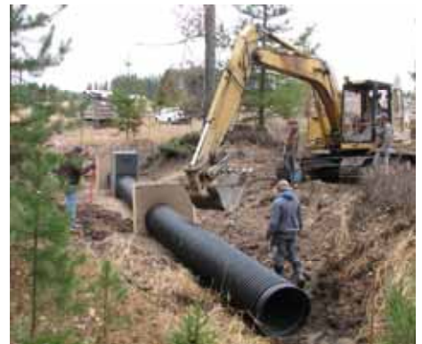
Matthew Brothers Construction installing the water control device for the Heekins' wetland restoration project.

One of the most unique and ecologically significant aspects of the Swan Valley is its vast array of small and mid-sized wetlands. These wetlands, and all of the connected riparian linkages running between them, function as high quality habitat for many of our most sensitive species, both plant and animal.