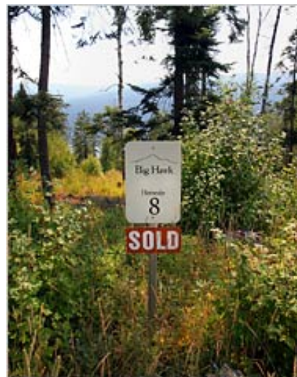
Plum Creek Timber sold this Montana home site.