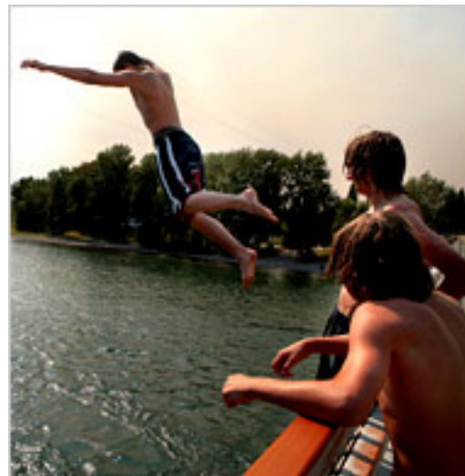
Boys jump into Flathead Lake in northwestern Montana, a region where the timber industry, private developers and local citizens compete for the interests of the land, rich in natural beauty and resources.