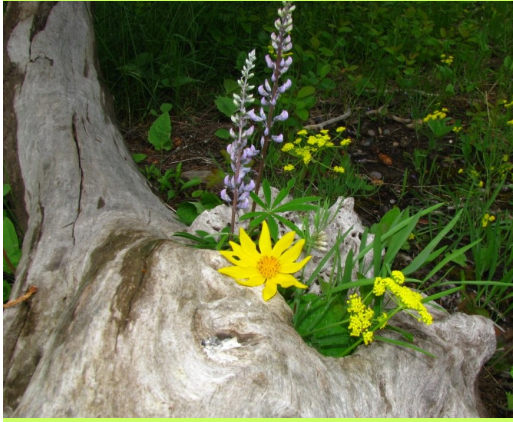
Arnica & lupine growing in a natural flower pot