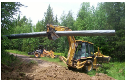
Culvert installation on the Herrick Run Road, 2009.

The BMP work consisted of installing new culverts, removing a failing culvert, constructing rolling dips and drain sags, and cleaning ditches, all to prevent erosion and direct the sediment runoff away from streams.