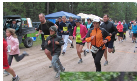
Top: Racers start the 10K, 5K and 1-mile running and walking events.

Twenty-three volunteers made the event a success. Funds raised support SEC's Mission Mountains Wilderness and Swan Front trails and campsites program.