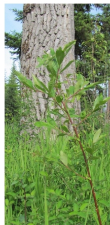
Newly planted sapling and mature cottonwood trunk.