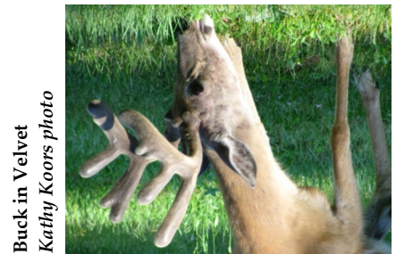
Buck in Velvet

6887 MT Highway 83, Condon, MT 59826—9005