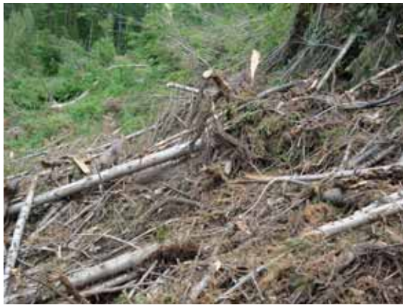
Avalanche debris covering trail to Upper Holland Lake.