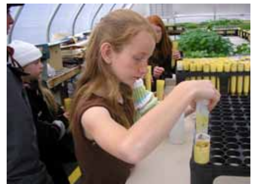
Above: After School Club field trip to Glacier National Park Nursery.