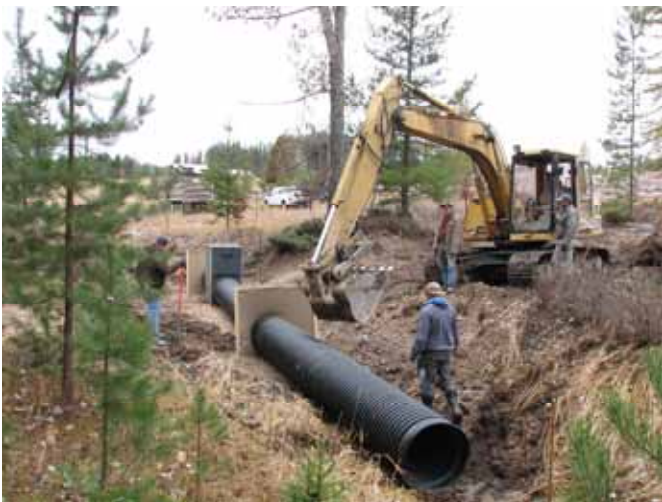
Mathew Brothers crew installing water control structure to reestablish a natural wetland on Heekin's property.

permanent water regime, meaning it remained flooded through the growing season in all but the driest years. After being drained, it functioned as a seasonal wetland, drying up early in the summer.