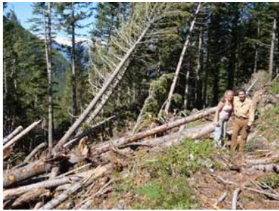
Avalanche debris 2009