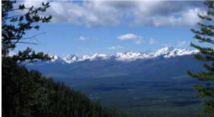
The Swan Valley and Mission Mountains.

the late 1990s when the Flathead National Forest acquired several sections around Lindbergh Lake. TNC joined the partnership more recently, playing a key role in initiating the Montana Legacy Project.