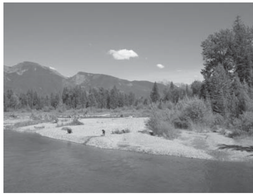
Swan River at Cold Creek bridge.

deep holes in the lake bottom that in summer lack adequate oxygen. Monitoring is primarily directed at