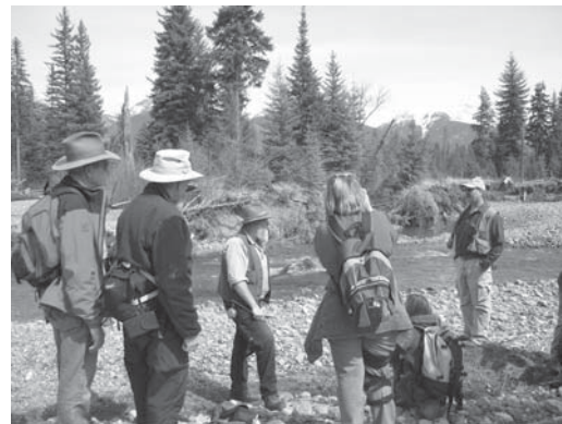
Elk Creek planning committee at work.

Conservation easements voluntarily contributed on private lands now total over 6,000 acres.